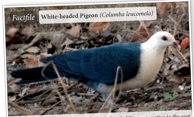
A large, very distinctive pigeon, the White-headed Pigeon is native to the east coast of Australia. It feeds on fruit and seeds but prefers laurels, particularly the introduced Camphor Laurel. The female is usually duller and greyer than the male. Its call is a loud, repeated Whoo...uk or melancholy ooms.

There are picnic tables, BBQs and a toilet available.